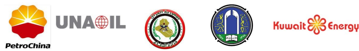
PetroChina UNA OIL Group Ministry of Defense Baghdad university Kuwait energy