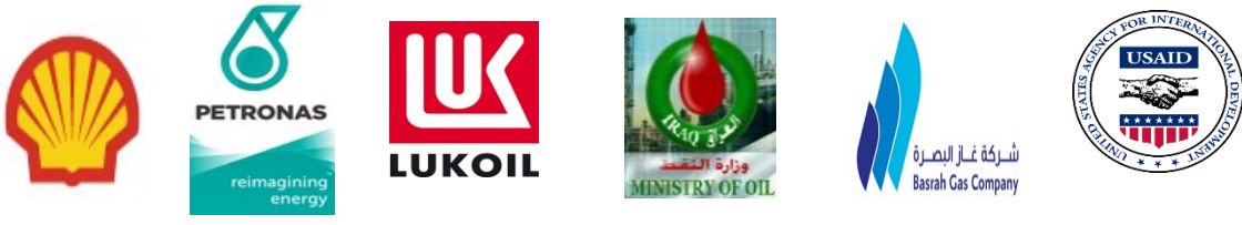
SHELL PETRONAS LUKOIL Minis. Of Oil Basrah Gas Co. USAID

Over the Past decade, ALKHORA has successfully implemented numerous projects for a wide range of clients, including various government agencies, organizations and multi-national companies, and military establishment. Our List of satisfied clients includes: