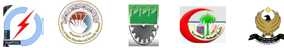
Ministry of Power Minis. Of higher education And Scientific Research Minis. Of Industry Basra Health Directorate Kurdistan Gov.